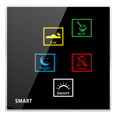
ART Touch Customizable Panels