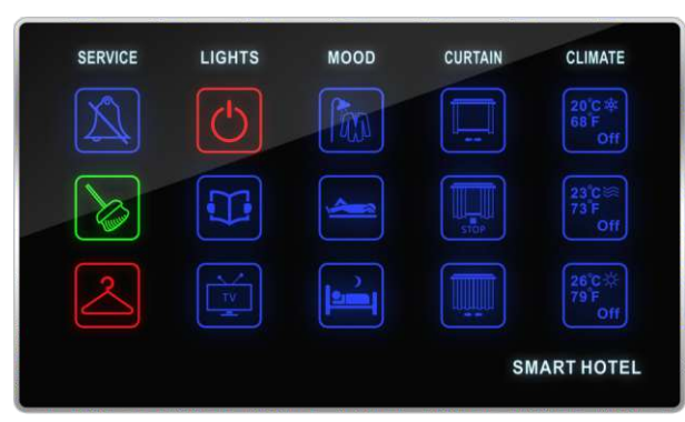
Smart Hotel Bedside